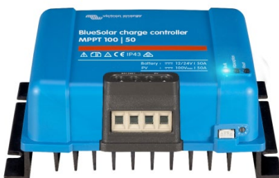
BlueSolar Charge Controller MPPT 100/50